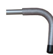
Handle padding +6,00 €